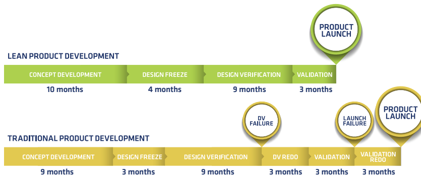
Figure 4. LPD vs Traditional Product Development

Figure 4 compares Lean Product Development with traditional product development. In this simulation, Design Freeze took slightly longer in the LPD model than in the traditional model. However, the end result is that LPD shaved 4 months off the product development timeline.